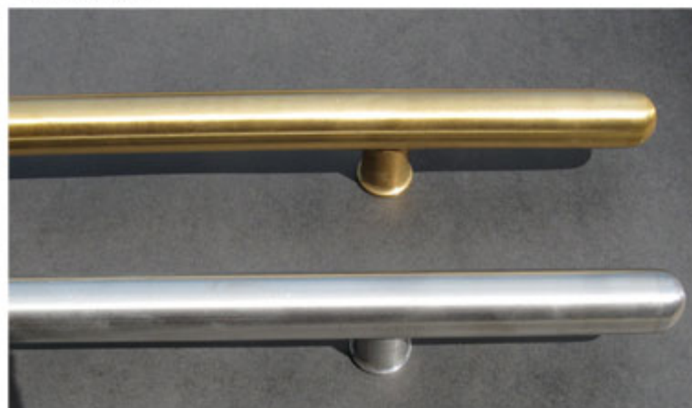
Stainless Steel or Brass Handrail