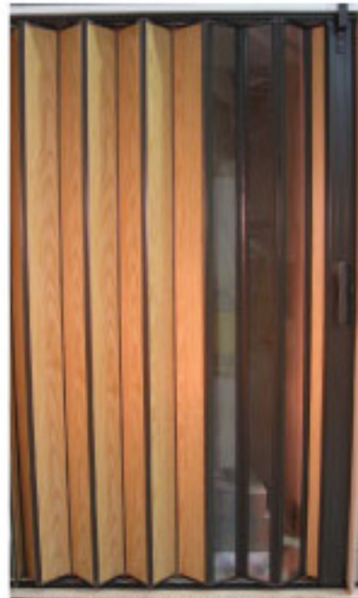
THREE VISION ACCORDION GATE